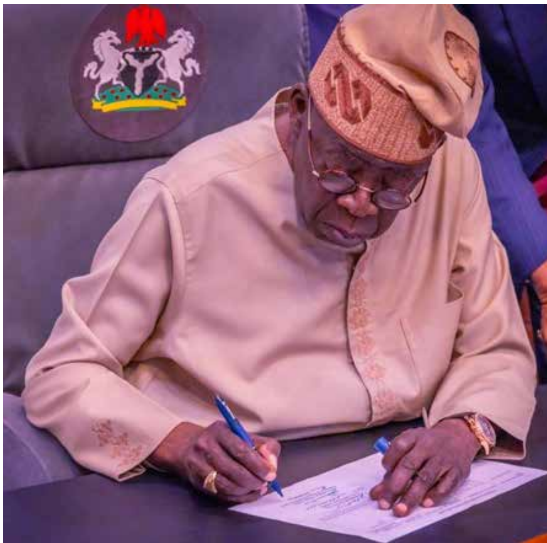
• President Tinubu

President Bola Tinubu has signed into law the 2026 Appropriation Bill of ₦68.32 trillion, while also approving an extension of the 2025 budget implementation period to June 30, 2026.