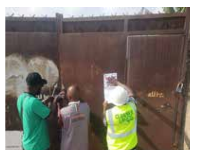
• LAWMA seals off premises

Gbadegesin urged residents to take responsibility for proper waste disposal by engaging only LAWMA-accredited PSP operators and reporting environmen-