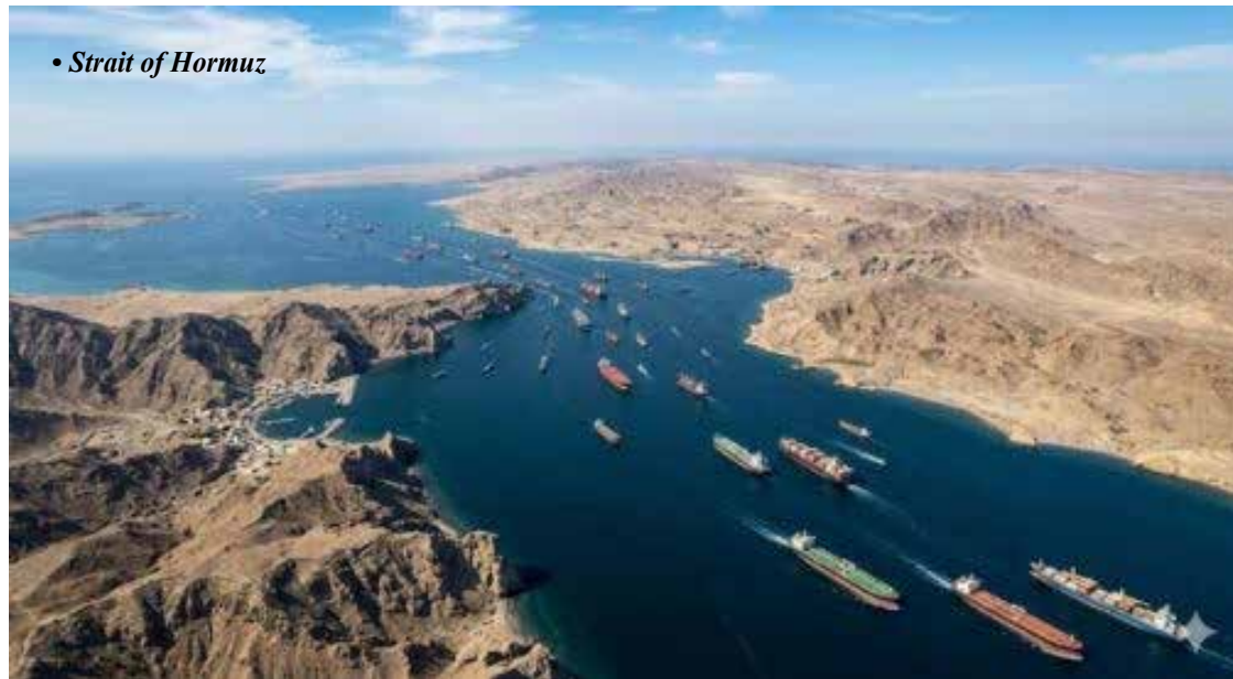
• Strait of Hormuz

Iran on Friday declared the strategic Strait of Hormuz "completely open" for commercial shipping for the duration of an ongoing ceasefire, marking a dramatic shift from days of disruption that rattled global oil markets and heightened fears of a wider regional conflict.