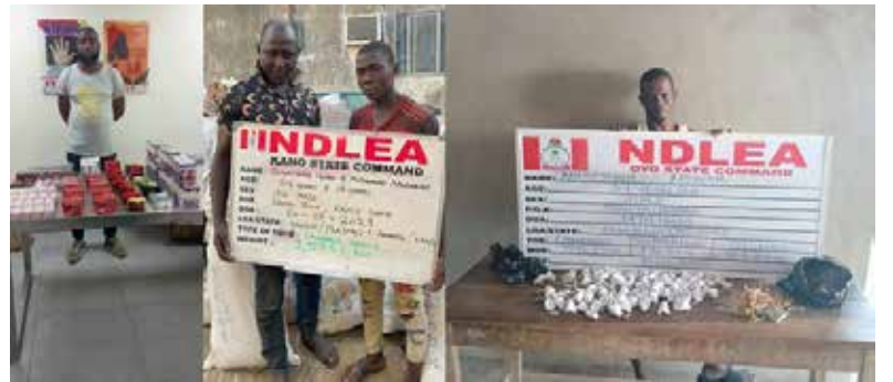
• Some of the convicts