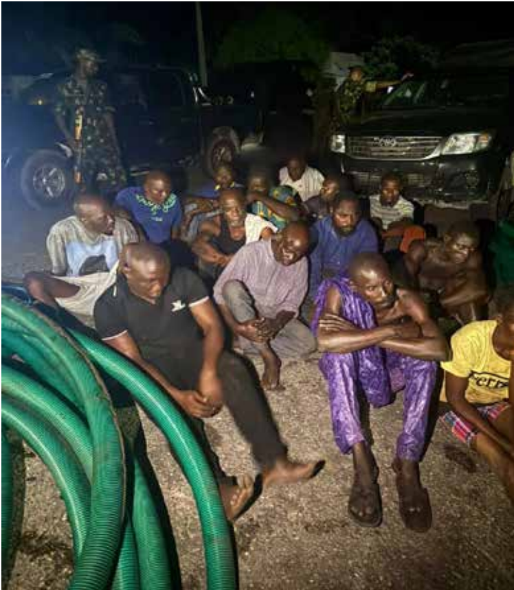
• Troops nab 15 suspected Oil Thieves At Dangote Refinery Discharge Point

intelligence, according to operational report of the Nigerian Army seen on Friday in Abuja.